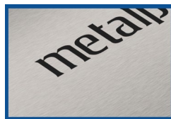
SATIN semi-gloss medium reflective material