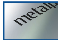
GLOSS highly reflective, mirror-like