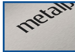
SATIN semi-gloss medium reflective material