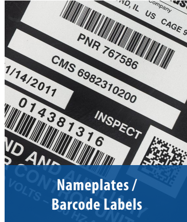
Nameplates / Barcode Labels