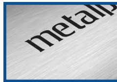
# 4 brushed to resemble a stainless steel finish