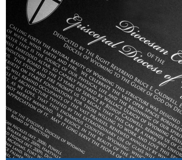
Wayfinding Signage & Blueprint Reproductions